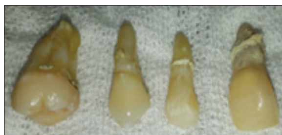
Fig. 2. Residual lost teeth.

and mobilizable areas to allow evacuation of excess impression material, thereby unloading compressed areas. Then, secondary impression was taken with Polysulfides (Fig. 5).