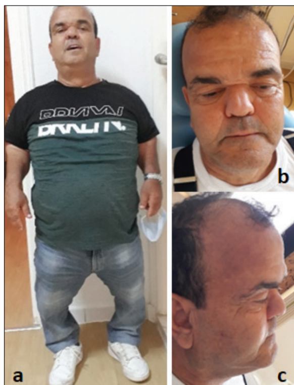
Fig. 1. Extra-oral examination; a – general posture of the patient, b – front facial view, c – profile facial view.