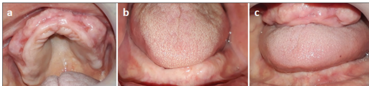
Fig. 3. Intra-oral examination; a – maxillary arcade, b – mandibular arcade, c – macroglossia.

Then occlusion was recorded. Small, triangular-shaped prosthetic teeth were chosen, reflecting the patient’s pre-extraction condition of microdontia and respecting the constrained prosthetic space, then mounted, ensuring proper centric relation and vertical dimension of occlusion while maintaining the balanced occlusion concept and respecting